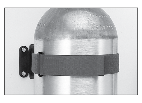
Cylinder Wall Bracket An economical solution in any work area. Mounts to the wall and secures any cylinder with a Velcro® safety belt.

The cylinder safety stand features two velcro® safety belts to support all size cylinders. A must for worker safety in the shop and on the job. Durable steel construction. Item # 30120